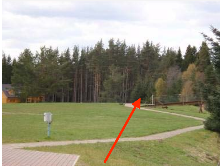
Fig. 5 : Proposed position of 6 wigwams