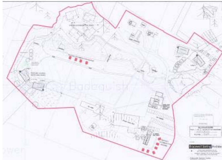
Fig. 3 : Approved position of wigwams (CNPA ref. no. 09/049/CP)