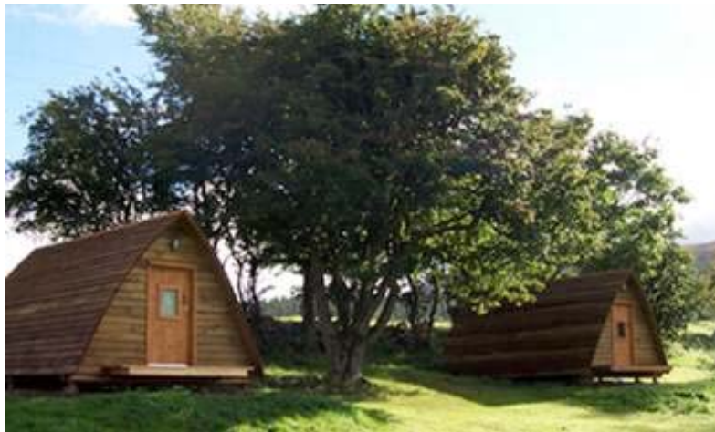
Fig. 2 : Examples of typical wigwams