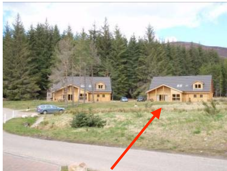
Fig. 6 : Proposed position of 4 wigwams